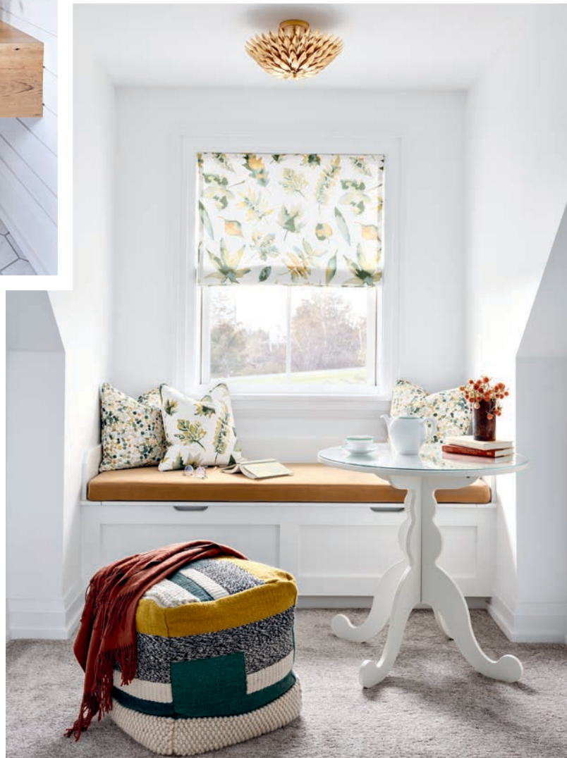
TABLE , IKEA. POUF , Crate & Kids. LIGHT FIXTURE , Crystorama. BLIND FABRIC , Clarke & Clarke.

One homeowner teaches piano from a new music studio above the garage. This nearby window seat offers a cozy perch for waiting parents or siblings. Lori let nature guide the design of these spaces. "P.E.I. is a rich and fertile island, and nature is all around," she says. "This property is situated on a beautiful estate made up of fields and forest. The natural patterns here reflect the natural beauty outside." The music room, which has its own bathroom and entrance, doubles as a guest suite.